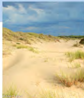
▲ white dunes

This diversity benefits from protection as a part of the European Natura 2000 network, as much for the conservation of a number of bird species (European Birds Directive) who find shelter and food in the dunes, on the beach, in the mudflats and salt marshes... as for its specific natural Atlantic coast habitats (European Habitats Directive).