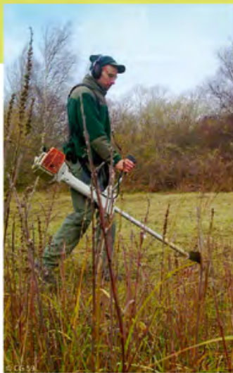
⚡ Management by mowing