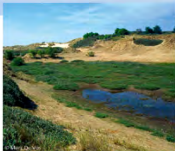
▲ humid dune slacks