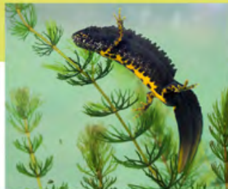
⌘ Great Crested Newt

Measures to restore natural habitats and the biotopes of endangered species include among other elements large scale removal of scrub, earthwork and the establishment of grazing areas. The day-to-day management of dune habitats include mowing and grazing by large herbivores (cattle, ponies, donkeys, sheep...).