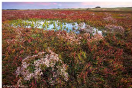
▲ salt marshes (schorre)

The prevailing northwest winds have sculpted "Flemish" dunes, i.e. very wide parabol or horseshoe shaped dunes that surround dune slacks.