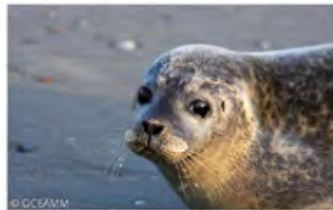
⌘ Common seal