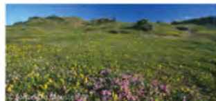
▲ grey dunes