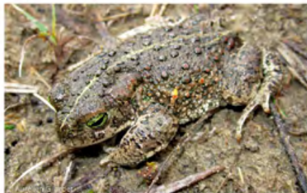
⚡ Natterjack toad