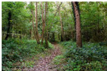
▲ wooded dunes

The Flemish coastal dunes are nature areas and landscapes of prime importance. Their ecological and scenery interest warrant the implementation of protective measures.