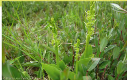
⚡ Fen orchid

A large part of the thousands of hectares of nature areas along the Flemish coast has been destroyed for various reasons: urbanisation, industrialisation, intensive farming... In the 70s, the need to safeguard these dune environments on both sides of the border led stakeholders to implement a number of protection and preservation measures. Today, in the cross border Maritime Flanders region, Belgian and French partners, the Nature and Forestry Agency of the Flemish Authority, the Département du Nord and the Conservatoire du Littoral et des Rivages Lacustres, are coming together to step up these measures.