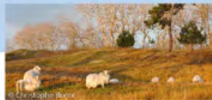
▲ fossil dunes