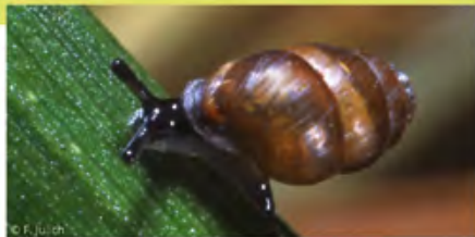
⌘ Narrow-mouthed whorl snail

Measures to restore natural habitats and the biotopes of endangered species include among other elements large scale removal of scrub, earthwork and the establishment of grazing areas. The day-to-day management of dune habitats include mowing and grazing by large herbivores (cattle, ponies, donkeys, sheep...).