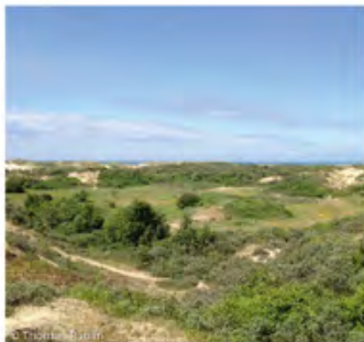
▲ "parabolic" dunes

Today, the once vast dune belt is fragmented into nature sanctuaries most often surrounded by urban areas. Several factors have led to shrub encroachment which results in a loss of biodiversity.