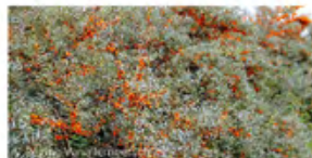
▲ dune scrub

That is why a large-scale, cross-border conservation project has been set up by French and Flemish authorities, with the support of the European Union: the LIFE + Nature Flandre (Flemish And North-french Dunes REstoration) project with a total budget of €4,066,454, of which 50% co-financed by the European Union and a duration of 5 years from 02/09/2013 to 01/09/2018. LIFE is an acronym in French for the European Funding programme for the environment (L'Instrument Financier européen pour l'Environnement).