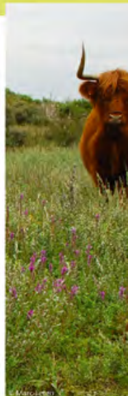
⚡ Highland cattle management