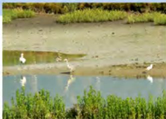
▲ mud flats (slikke)