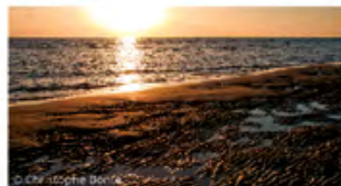
▲ sandy beaches